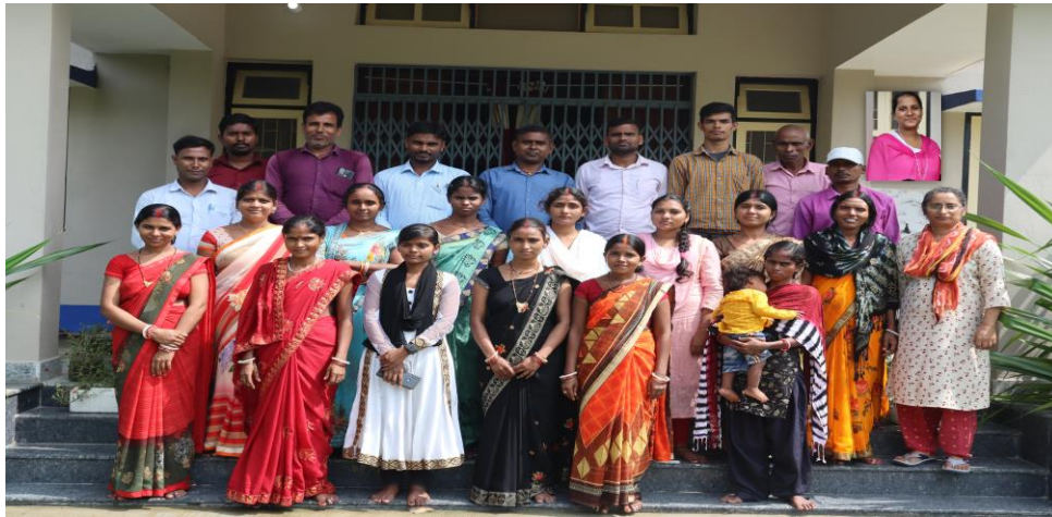
The team of Mary Ward Development Centre

Our presence in the crowd as Church personnel was quite conspicuous as the people on the dais talked among themselves “church people are also here”. We felt happy to be among the citizens of the Nation with the issues of the people, claiming our constitutional rights.